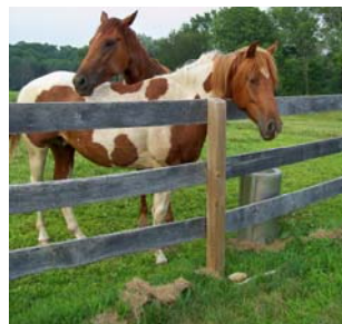
Freckles and Pierre, Summer 2008