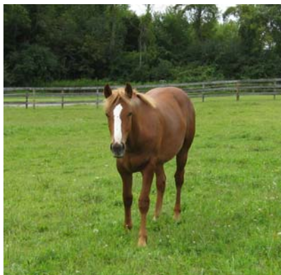
Freckles, Summer 2006